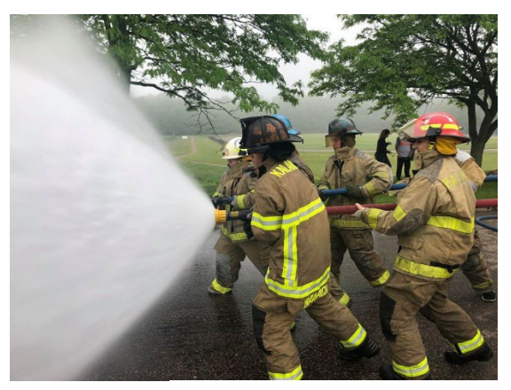
Public Safety Officer Training